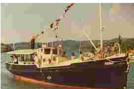
The MV Krait during WW2