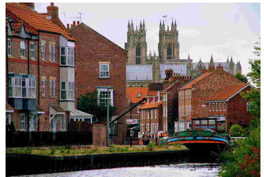
A view of Beverley Beck, Lincs. UK