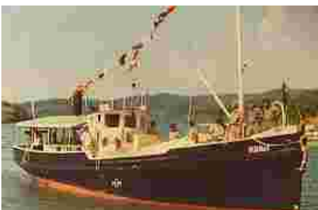
The MV Krait during WW2