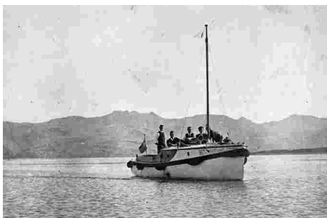
The Nautilus in the 1920s